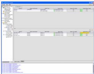
Device List Manager