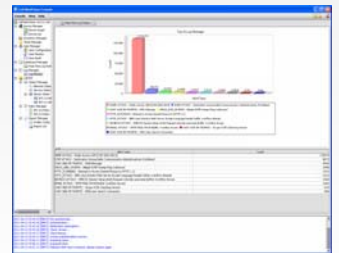
Log Statistic Report